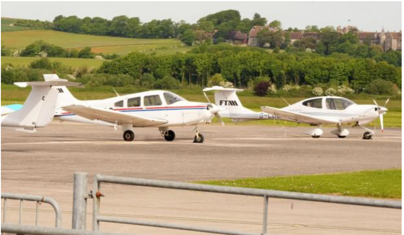
Grounded planes at the airport

The trainees, who have spent close to £100,000 to qualify as pilots, were sent an email by boss Sean Jacob informing them that the school had closed last night.