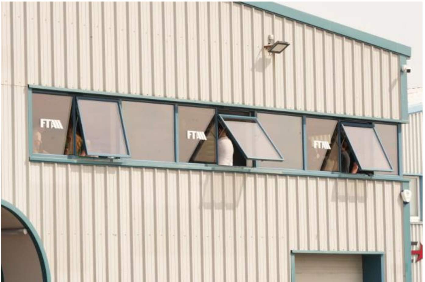
Concerned parents gathered in a meeting room in the hangar

"The Civil Aviation Authority needs to take some responsibility."